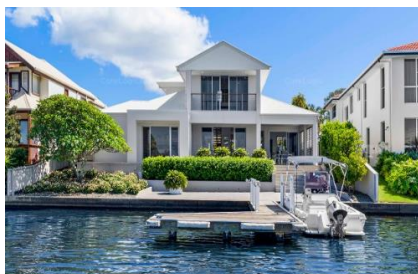
17 The Anchorage | Noosa Waters 3 Bed | 3 Bath | 2 Car Sold 01/05/22 | $4,600,000