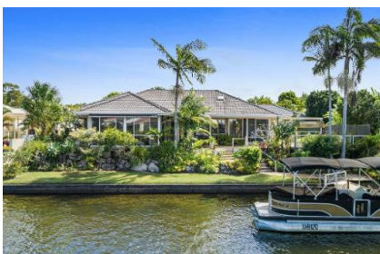
3 Shorehaven Dr | Noosa Waters 5 Bed | 3 Bath | 4 Car Sold 06/06/2022 | $3,800,000