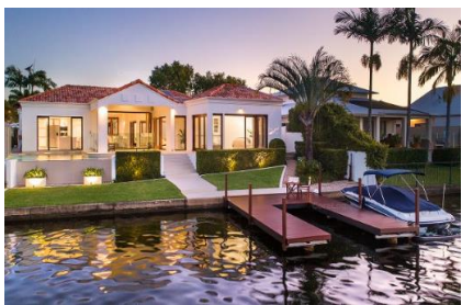
115 Shorehaven Dr | Noosa Waters 4 Bed | 3 Bath | 2 Car Sold 21/05/2021 | $4,000,000