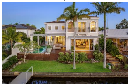
7 The Peninsula | Noosa Waters 4 Bed | 3 Bath | 2 Car Sold 20/12/2021 | $4,575,000