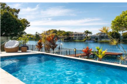
41 Shorehaven Dr | Noosa Waters 4 Bed | 2 Bath | 2 Car Sold 29/09/2021 | $3,810,000