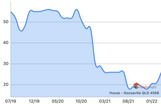
Median Days on Market 07/19 - 03/22