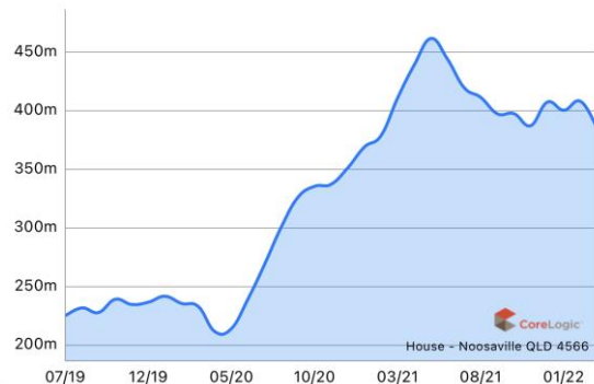
Total Value of Sales 07/19 - 03/22