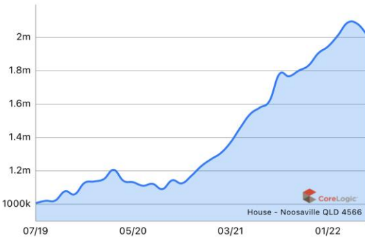
Median Value 07/19 - 05/22