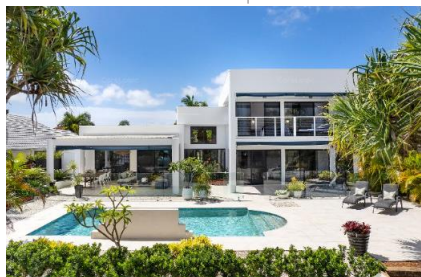
20 Seamount Quay | Noosa Waters 4 Bed | 3 Bath | 2 Car Sold 06/04/2022 | $4,710,000