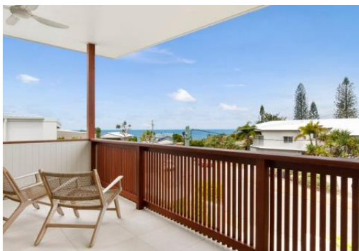
5B Ventura Street | Sunrise Beach SOLD 7 th March 2023 | $2,015,000 3 Bed | 2 Bath | 2 Car