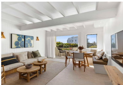
3/4 Park Crescent | Sunshine Beach SOLD 12 th Jan 2023 | $1,710,000 2 Bed | 2 Bath | 1 Car