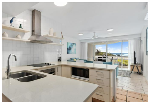
7/5 Belmore Terrace | Sunshine Beach SOLD 1 st April 2022 | $1,475,000 2 Bed | 2 Bath | 1 Car