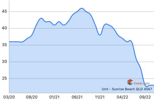
Number of Sales 03/20 - 11/22