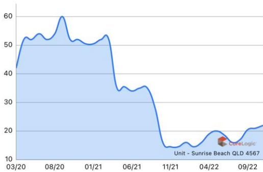
Median Days on Market 03/20 - 11/22