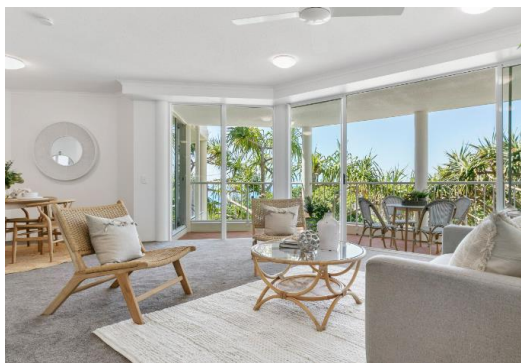
3/2 Selene Street | Sunrise Beach SOLD 20 th April 2022 | $2,050,000 3 Bed | 2 Bath | 1 Car