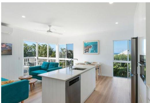
2/24 Orealla Crescent | Sunrise Beach SOLD 4 th May 2022 | $1,400,000 3 Bed | 2 Bath | 1 Car