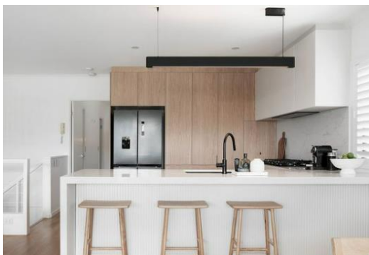
1/40 Ventura Street | Sunrise Beach SOLD 20 th Dec 2022 | $1,830,000 3 Bed | 2 Bath | 2 Car