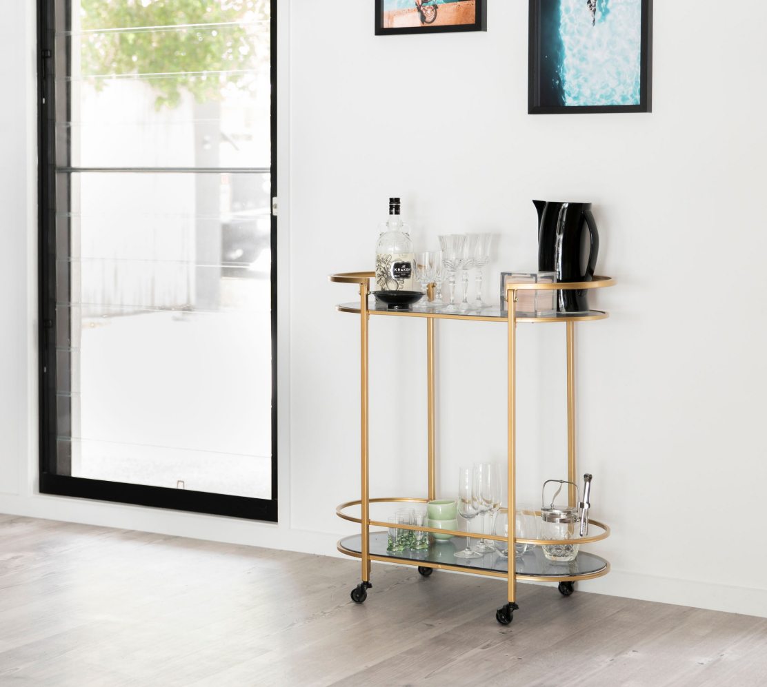
Designed & styled by Simone Barter Design Studio