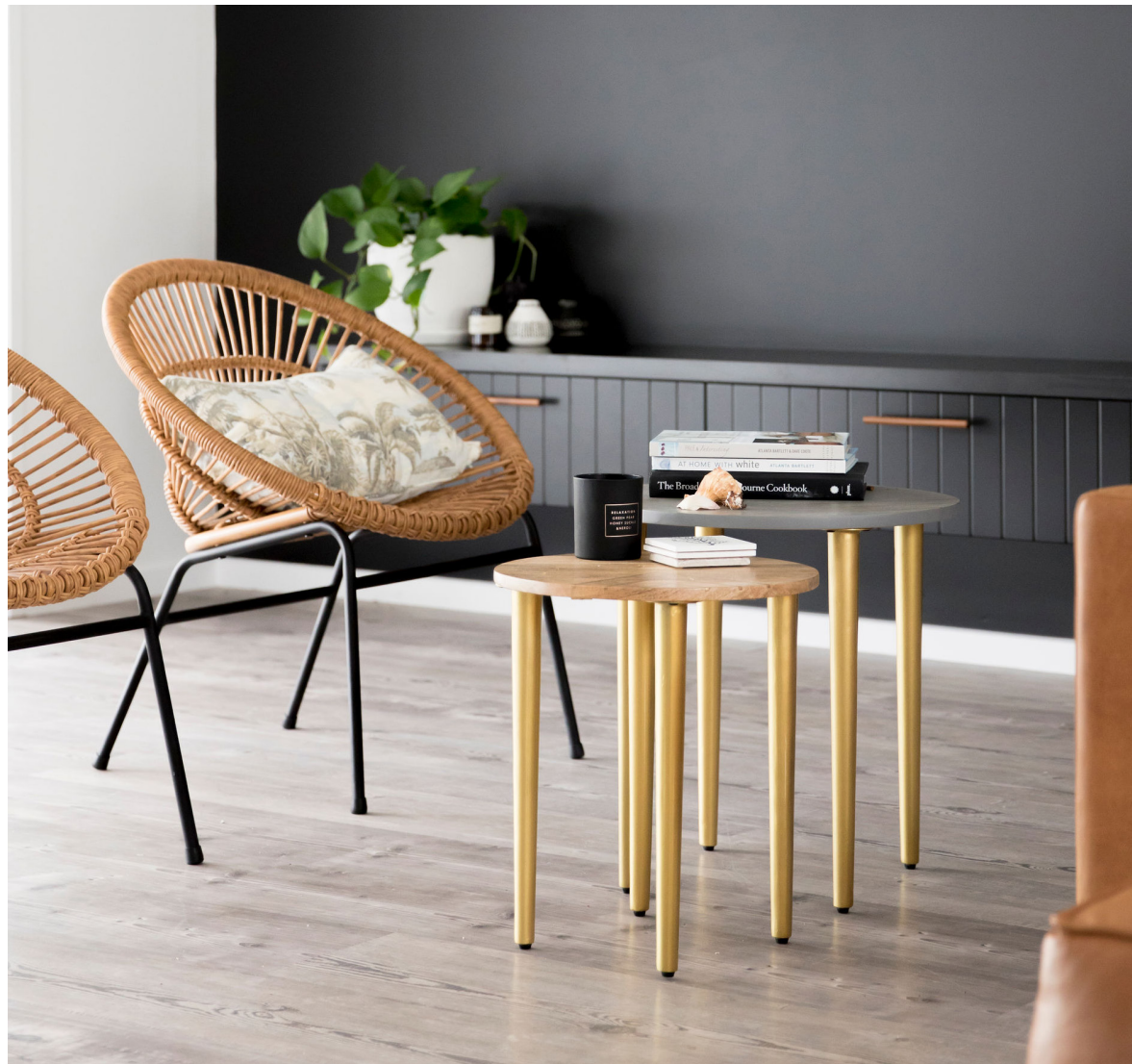
Designed & styled by Simone Barter Design Studio

Essential to any true coastal luxe styled living area is a variety of stylish homewares, comfortable sofas and occasional chairs. Most commonly, colours are muted greys, greens and blues with an added texture of tan leather. Extra furnishings like coffee tables, sideboards and dining tables tend to be made of organic oak timbers to add a touch of earthiness.