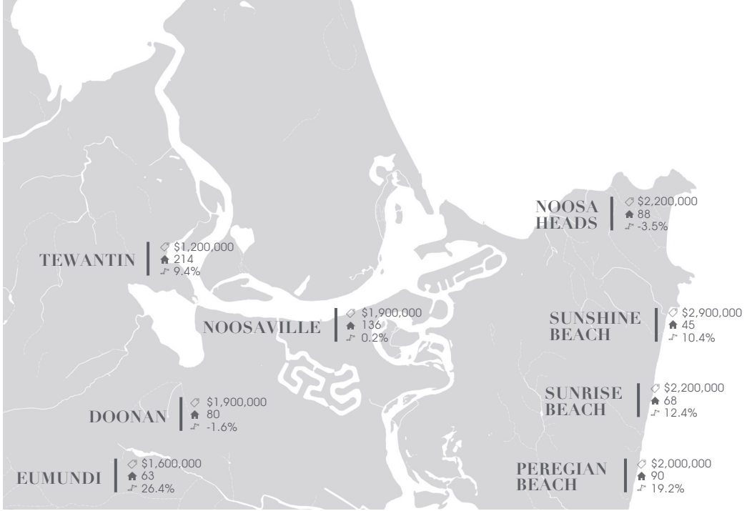
🏠 Median House Price 🏡 Total Market Sales 12 Months ↕ Change in Median House Price Data from April 2025 - March 2026