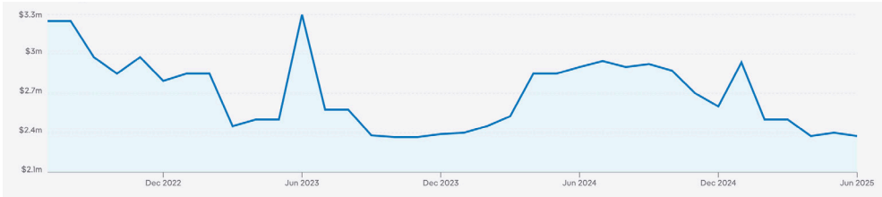
Sold Volume (2 years)