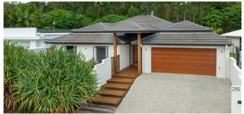
26 Rani Court, Noosaville 4 bed | 2 bath | 2 car $2,400,000 | SOLD May 2024