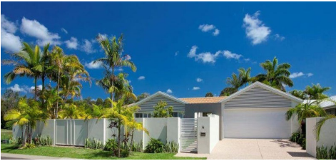
6 Seashell Place, Noosaville 4 bed | 2 bath | 2 car $2,245,000 | SOLD November 2024