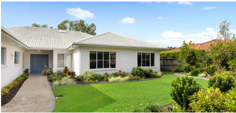
5 Broadreach Court, Noosaville 4 bed | 2 bath | 2 car $2,406,000 | SOLD November 2024