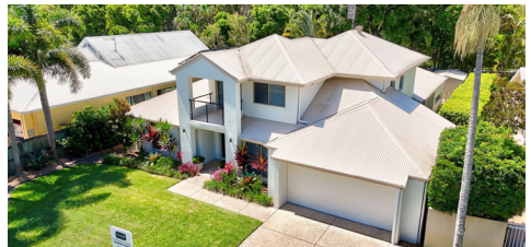
194 Shorehaven Drive, Noosaville 5 bed | 3 bath | 2 car $2,300,000 | SOLD March 2024