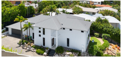
17 Treasure Cove, Noosaville 3 bed | 2 bath | 2 car $2,120,000 | SOLD August 2024