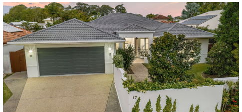
17 Headland Drive, Noosaville 4 bed | 2 bath | 2 car $2,050,000 | SOLD August 2024