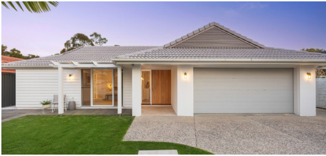
21 Aquamarine Circuit, Noosaville 5 bed | 2 bath | 2 car $2,725,000 | SOLD September 2024