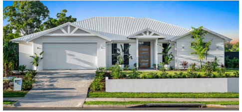
9 Ely Street, Noosaville 4 bed | 2 bath | 2 car $2,300,000 | SOLD August 2024