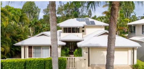
140 Shorehaven Drive, Noosaville 4 bed | 2 bath | 2 car $2,320,000 | SOLD August 2024