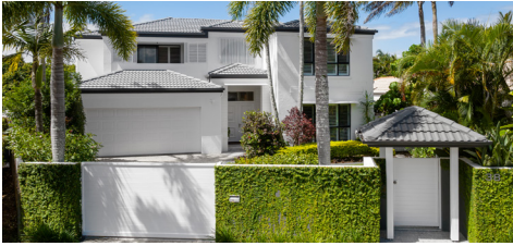
38 Waterside Court, Noosaville 4 bed | 3 bath | 2 car $3,050,000 | SOLD September 2024