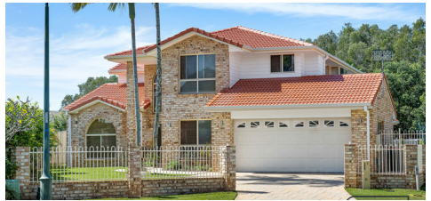
7 Windsurf Place, Noosaville 4 bed | 3 bath | 2 car $2,065,000 | SOLD May 2024