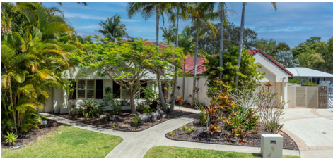
9 Oceanmist Court, Noosaville 4 bed | 3 bath | 2 car $2,100,000 | SOLD November 2024