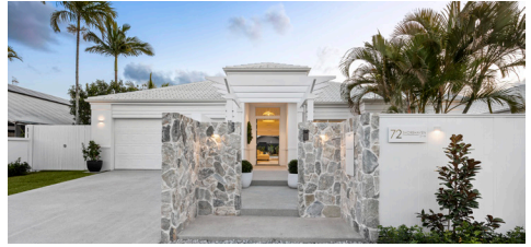
72 Shorehaven Drive, Noosaville 4 bed | 2 bath | 2 car $2,800,000 | SOLD January 2024