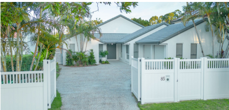
85 Saltwater Avenue, Noosaville 4 bed | 2 bath | 2 car $2,050,000 | SOLD September 2024