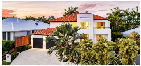
12 Regatta Circuit, Noosaville 4 bed | 3 bath | 3 car $2,480,000 | SOLD July 2024