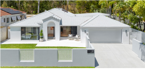
50 Shipyard Circuit, Noosaville 5 bed | 2 bath | 2 car $2,300,000 | SOLD February 2024