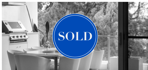
15/8 Serenity Close, Noosa Heads 3 bed | 3 bath | 2 car $3,400,000 | SOLD July 2022