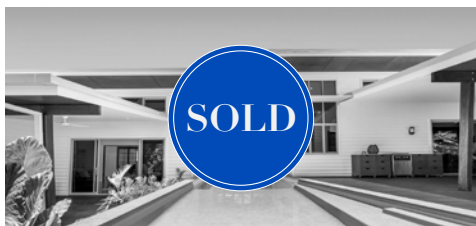
12 Grosvenor Terrace, Noosa Heads 5 bed | 3 bath | 4 car $5,600,000 | SOLD May 2023