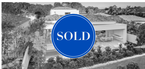
21 Springs Crescent, Noosa Heads 4 bed | 4 bath | 2 car $4,700,000 | SOLD June 2023