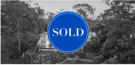
351 Duke Road, Doonan 5 bed | 3 bath | 4 car $3,325,000 | SOLD June 2023