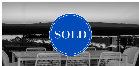
36/37-39 Noosa Drive, Noosa Heads 3 bed | 2 bath | 2 car $4,000,000 | SOLD August 2023