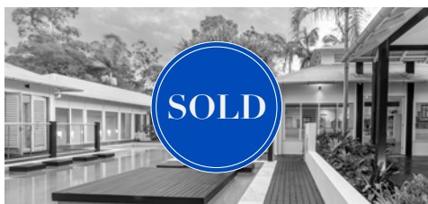
13 Habitat Place, Noosa Heads 4 bed | 2 bath | 3 car $3,610,000 | SOLD July 2023