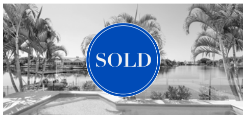
17 Shorehaven Drive, Noosa Waters 4 bed | 2 bath | 3 car $5,000,000 | SOLD May 2023