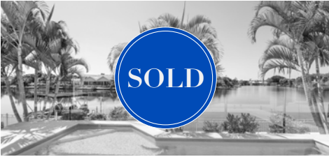
17 Shorehaven Drive, Noosa Waters 4 bed | 2 bath | 3 car $5,000,000 | SOLD May 2023