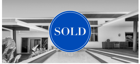
12 Grosvenor Terrace, Noosa Heads 5 bed | 3 bath | 4 car $5,600,000 | SOLD May 2023