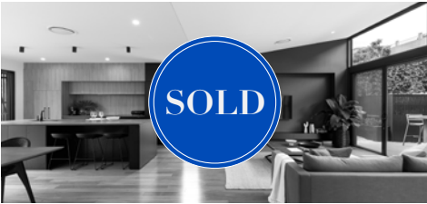
26 Warana Street, Noosa Heads 3 bed | 3 bath | 2 car $2,780,000 | SOLD June 2023