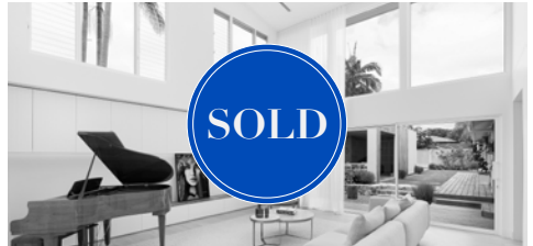
24 Newfield Street, Sunrise Beach 5 bed | 3 bath | 2 car $3,380,000 | SOLD June 2023