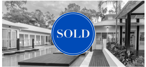
13 Habitat Place, Noosa Heads 4 bed | 2 bath | 3 car $3,610,000 | SOLD July 2023