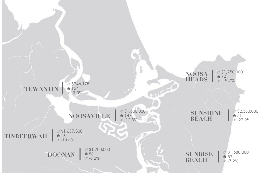
📍 Median House Price 🏠 Total Market Sales 12 Months 📈 Change in Median House Price Data from October 2022 - September 2023