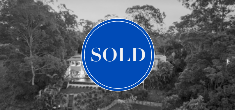
351 Duke Road, Doonan 5 bed | 3 bath | 4 car $3,325,000 | SOLD June 2023