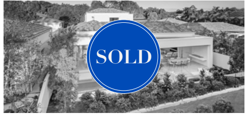
21 Springs Crescent, Noosa Heads 4 bed | 4 bath | 2 car $4,700,000 | SOLD June 2023