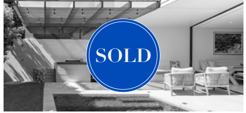
2/7 Elizabeth Street, Noosaville 4 bed | 3 bath | 2 car $3,010,000 | SOLD September 2023