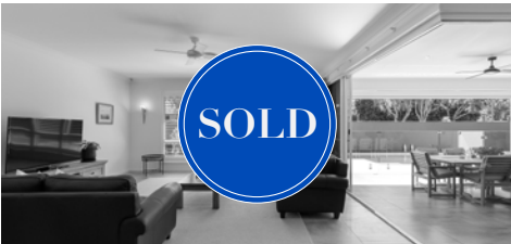
25 Seacove Court, Noosaville 5 bed | 3 bath | 2 car $2,550,000 | SOLD August 2023