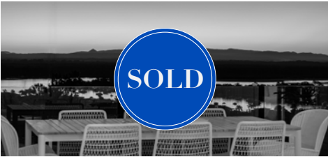
36/37-39 Noosa Drive, Noosa Heads 3 bed | 2 bath | 2 car $4,000,000 | SOLD August 2023