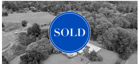
477 Gold Creek Road, Eerwah Vale 4 bed | 2 bath | 4 car $2,300,000 | SOLD September 2023