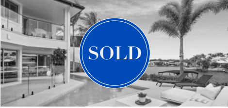
8 Mermaid Quay, Noosa Waters 5 bed | 4 bath | 2 car $6,050,000 | SOLD August 2023