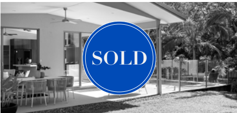
36 Banksia Avenue, Noosa Heads 3 bed | 2 bath | 4 car $2,225,000 | SOLD June 2023