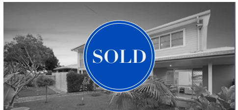
5 Paluma Street, Sunrise Beach 4 bed | 4 bath | 2 car $2,100,000 | SOLD July 2023