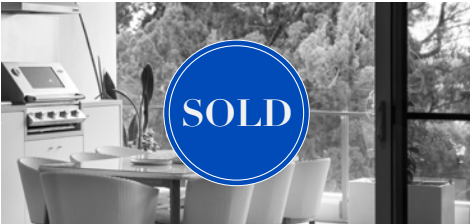
15/8 Serenity Close, Noosa Heads 3 bed | 3 bath | 2 car $3,400,000 | SOLD July 2022