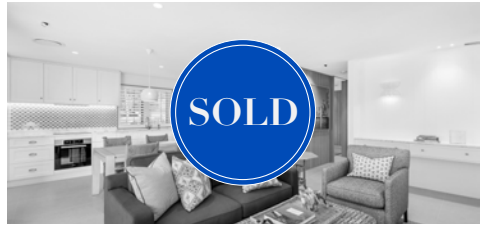
4/35 Picture Point Crescent, Noosa Heads 1 bed | 1 bath | 1 car $2,750,000 | SOLD May 2023