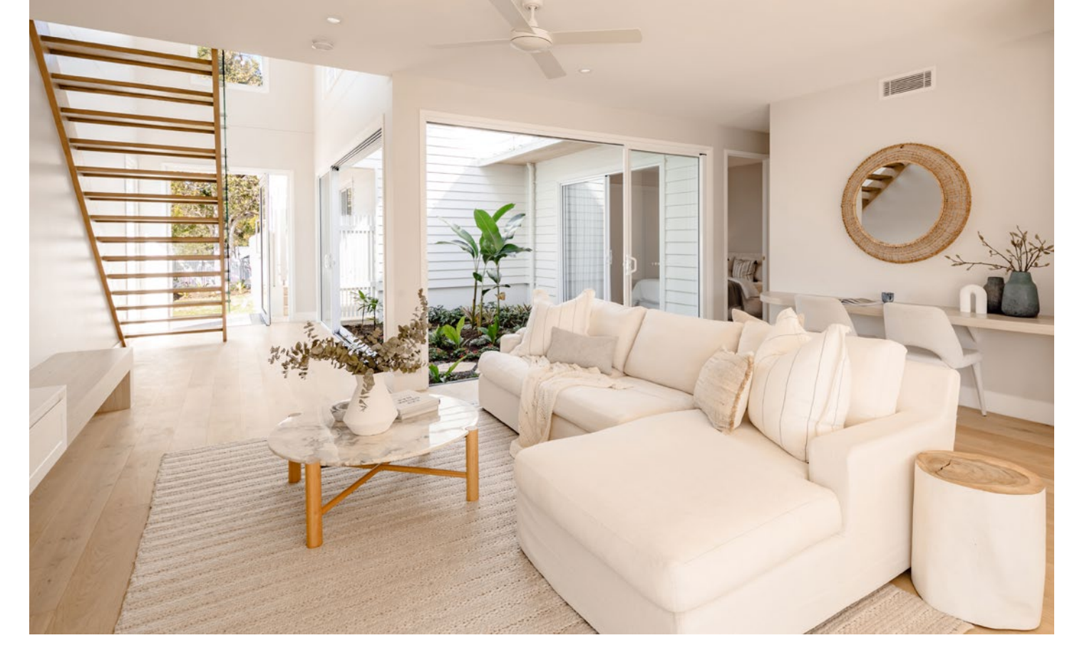
Designed by Black and White Projects Styled by Blink Living