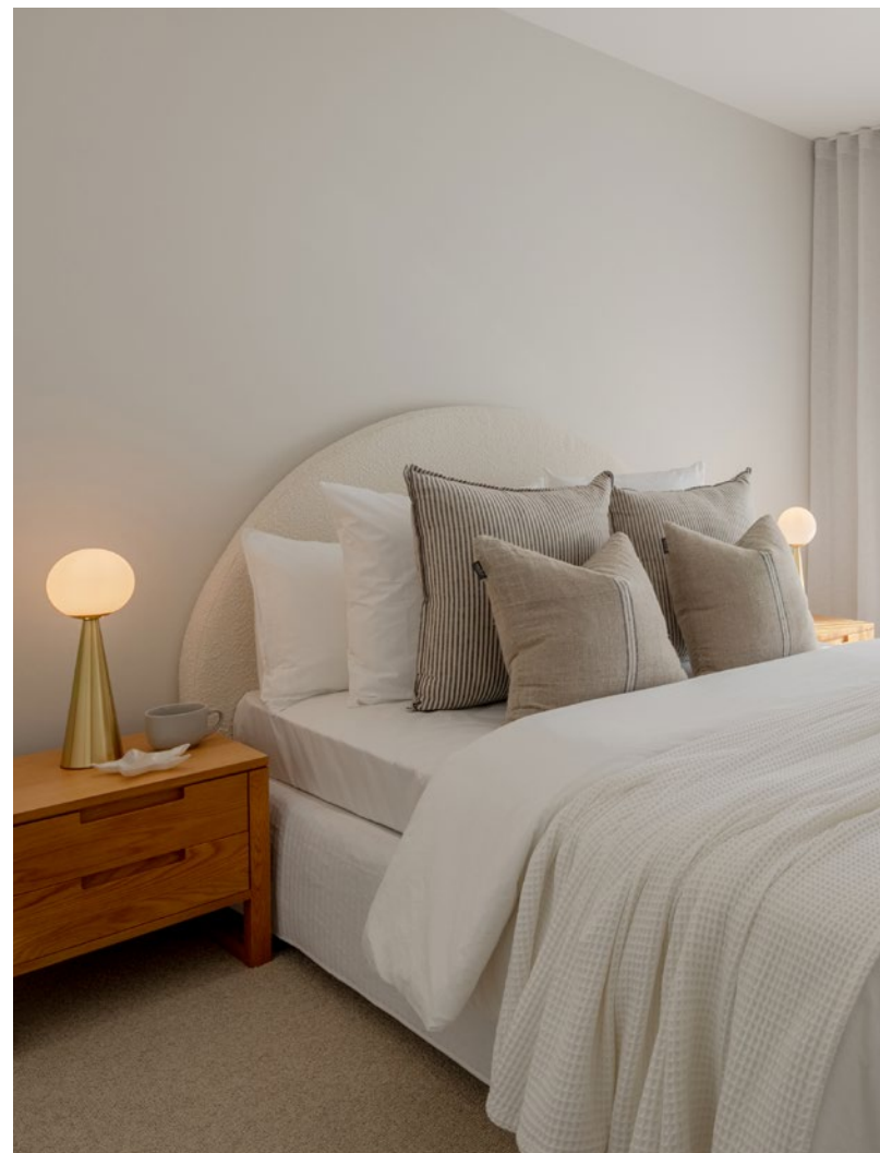
Designed by Black and White Projects Styled by Blink Living

In terms of modern coastal artwork and decor, the options are endless, but it's important to remember that less is more. Choose pieces that follow the coastal style theme and include pops of colour in line with your chosen palette. Try not to over think it, the most beautifully styled bedrooms always include a perfectly balanced amount of empty space.