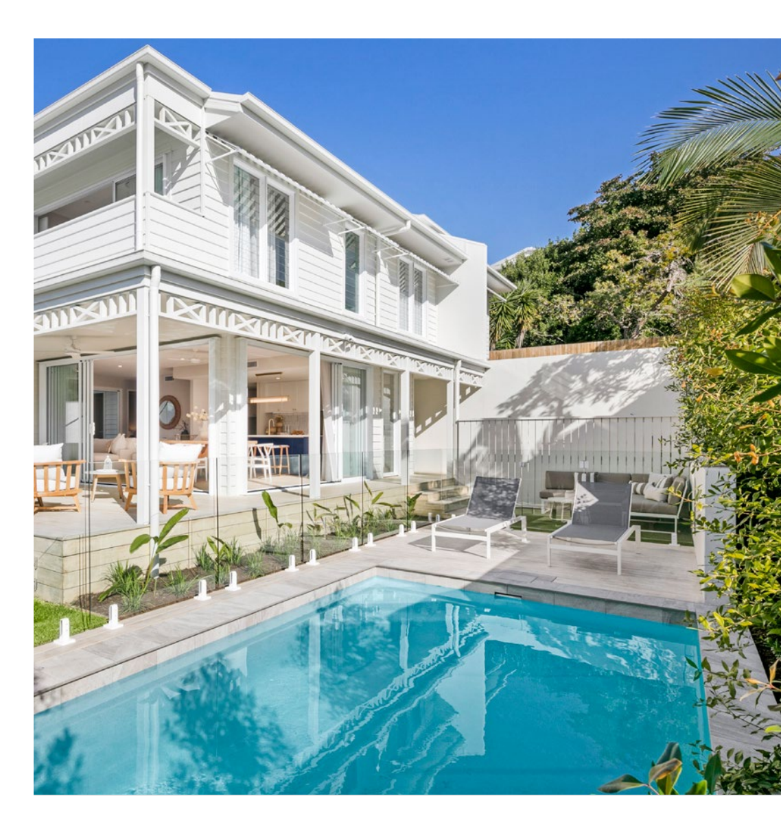
Designed by Black and White Projects Styled by Blink Living

If your backyard features a swimming pool, you're in serious luck, as nothing says `coastal retreat' like lounging around by your own pool. Finish off the look by investing in some timber poolside furniture in a crisp, classic white. Add in some potted plants and for something truly sophisticated, consider surrounding the pool area in durable glass fencing.